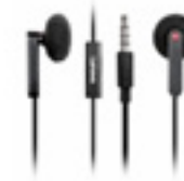
Lenovo On-Ear-Headphones 4XDOJ65079