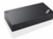
ThinkPad USB-C Dock 40A90090XX