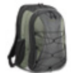
Lenovo Performance Backpack 41U5254