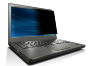
Lenovo Privacy Filter