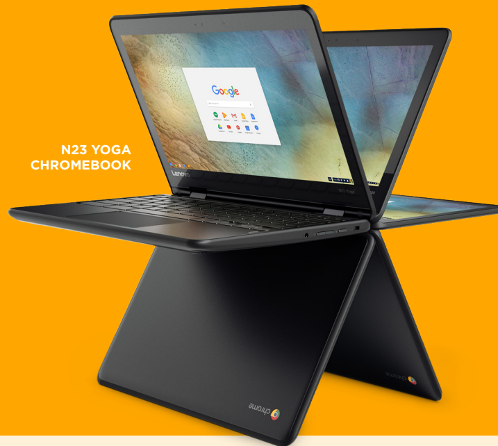
N23 YOGA CHROMEBOOK