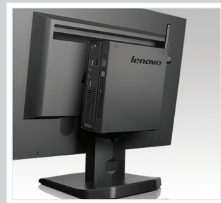
MORE PRODUCTIVE, LESS CLUTTER Integrated stereo speakers and VESA bracket for a Tiny PC enable optimal space management