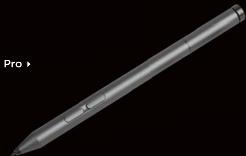
Lenovo Pen Pro ▶