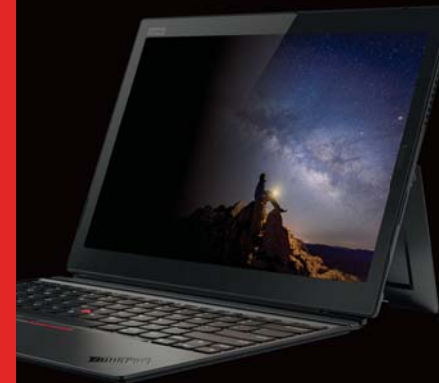
◀ Lenovo Privacy Filter for X1 Tablet G3 from 3M