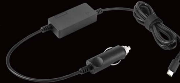
Lenovo 65W ▶ USB-C DC Adapter