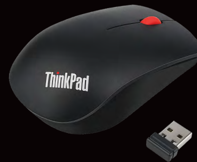
◀ ThinkPad Essential Wireless Mouse