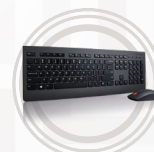
Lenovo Professional Wireless Keyboard & Mouse Combo