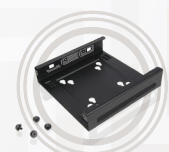
ThinkCentre Tiny VESA Mount II