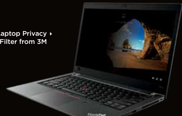
Lenovo Laptop Privacy ▶ Filter from 3M