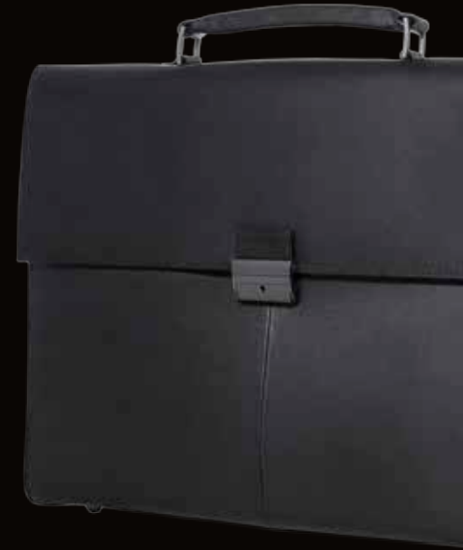
Lenovo Professional ▶ Topload Case