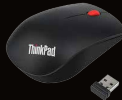
◀ ThinkPad Essential Wireless Mouse