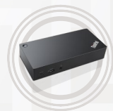
ThinkPad Thunderbolt 3 Dock