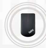
ThinkPad X1 Wireless Touch Mouse