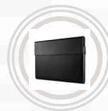
ThinkPad X1 Ultra Sleeve