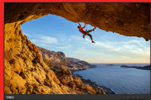
WUXGA 1920 x 1200