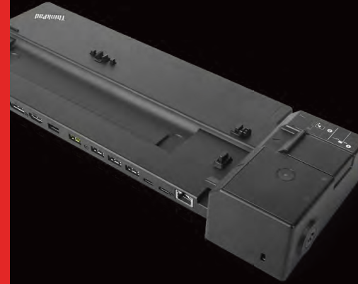
◀ ThinkPad Ultra Dock