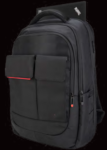
ThinkPad Professional ▶ Backpack