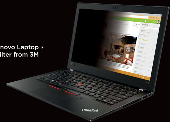
Lenovo Laptop ▶ Privacy Filter from 3M